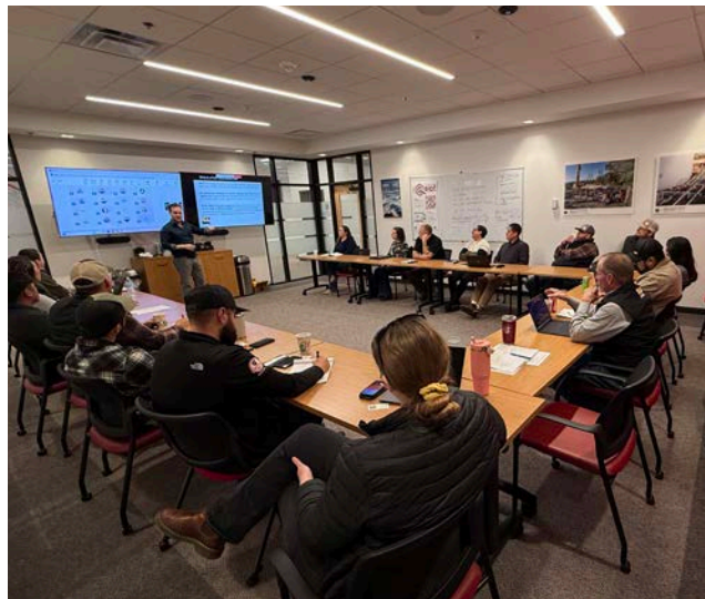
The Project Labor Agreements (PLA) module led by external partner United Contractors at UCCo HQ.

For questions about Core Competency requirements or technical support, email The Academy Board at academy@undergroundconstruction.com